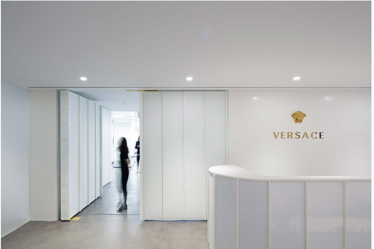
Reception and showroom entry